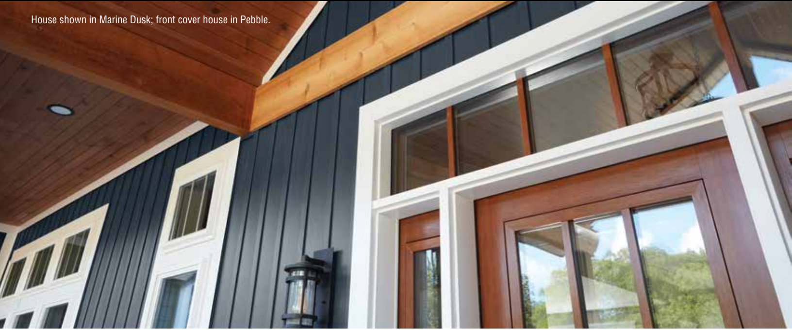
House shown in Marine Dusk; front cover house in Pebble.

Never Needs to Be Painted High-performance vinyl colour won't chip, flake or peel.