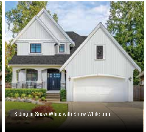
Siding in Snow White with Snow White trim.