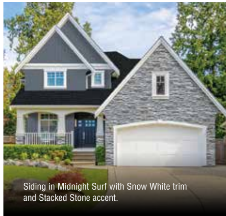
Siding in Midnight Surf with Snow White trim and Stacked Stone accent.

No need to settle for siding and trim that "almost match." Our Colour Clear Through® collection of customer-preferred hues helps ensure a beautiful colour match with other Gentek siding, trim and accessory products.